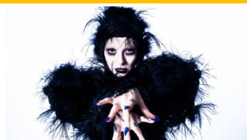
Ireland Bambie Thug - Doomsday Blue